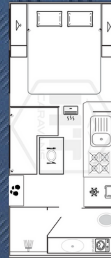
17'6" RD Feathertop aka H17