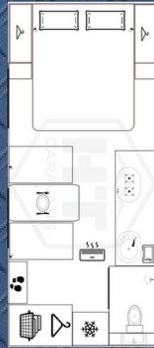
16' Kalbarri aka H16