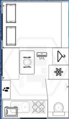
13' Karijini aka H13