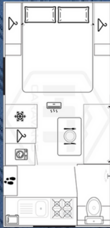
15' Karijini aka H15