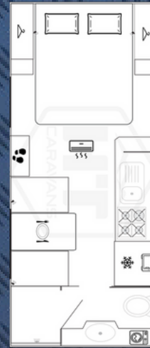
17'6" MD Feathertop aka H17